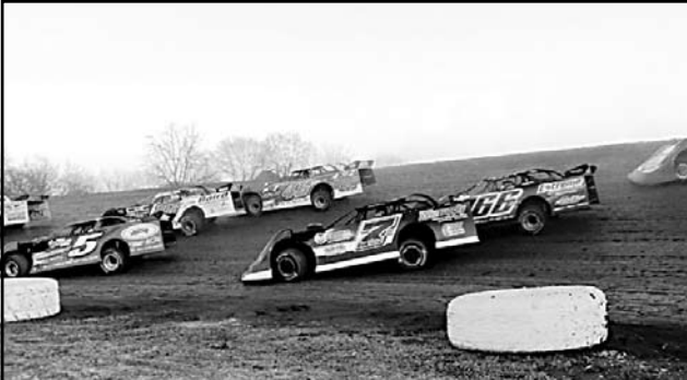
THE START OF 50 LAPS OF LATE MODEL