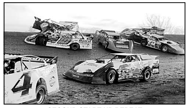
SECOND START UP REPEAT