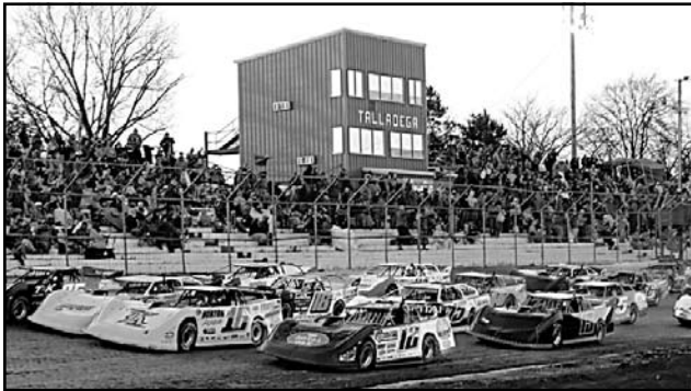
FANS AND 4 WIDE SALUTE