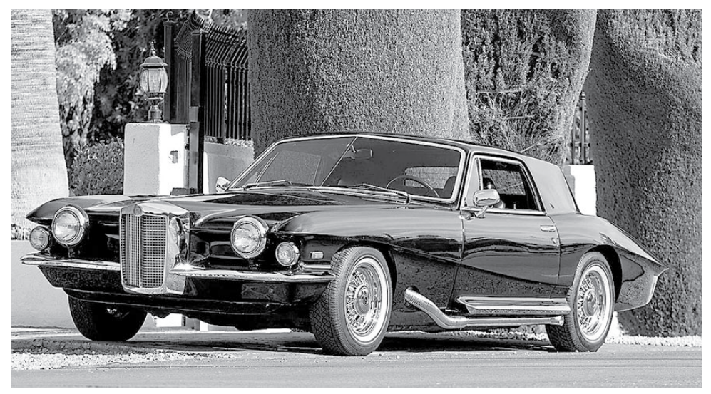
1971 Stutz Blackhawk Formerly Owned by Elvis Presley (Lot S103) Sold at $297,000

For access to complete auction results, sign up for a free MyMecum account at Mecum.com. Next up the World's Largest Collector Car Auction® in Kissimmee, Florida, Jan. 4-15 featuring an anticipated 4,000 classic and collector cars. For more details on upcoming auctions, to consign a vehicle or to register as a bidder, visit Mecum.com, or call (262) 275-5050 for more information.