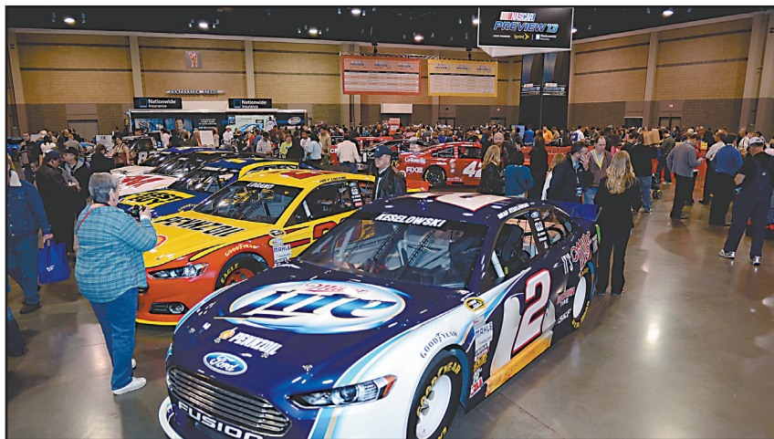
Race Fans attend the Nascar Preview at NASCAR Hall of Fame on February 9, 2013 in Charlotte, North Carolina.

lotte Convention Center included the hall's induction of the Class of 2013 and the popular NASCAR Preview 2013 featuring driver appearances, up-close viewing of the NASCAR Gen-6 race cars, autograph sessions and fan Q&As.