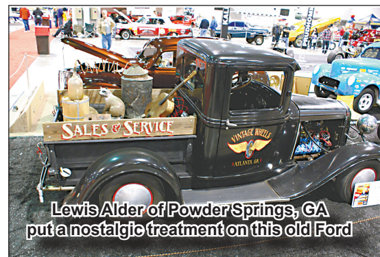
Lewis Alder of Powder Springs, GA put a nostalgic treatment on this old Ford