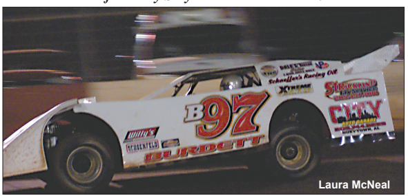
Red Farmer's grandson drove the B97 that night.