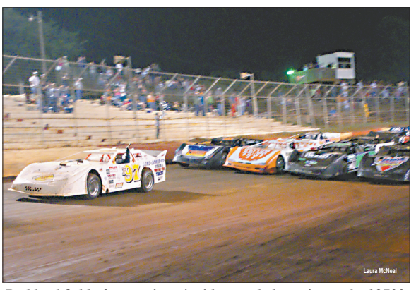
Red lead field of racers in a 4-wide parade lap prior to the $9700 main event of the Red Farmer Classic.