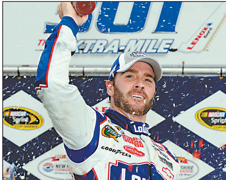
Jimmie Johnson celebrates his second consecutive win after winning in Sonoma, Calif. as he climbs out of the No. 48 car Sunday at New Hampshire Motor Speedway in Loudon, N.H.