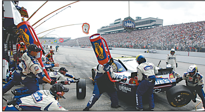
Early in the race, a problem in the No. 48 pit dropped Jimmie Johnson back in the field at New Hampshire Motor Speedway Sunday in Loudon, N.H.