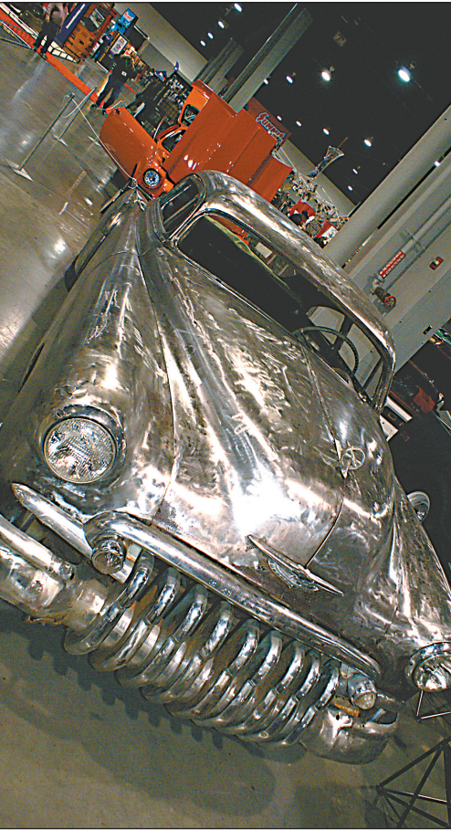
RONNY SORROWS OF DALLAS GA: A '50 CHEVY FLEETLINER WORK IN PROGRESS