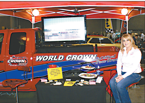
GRESHAM MOTORSPORTS PARK BOOTH