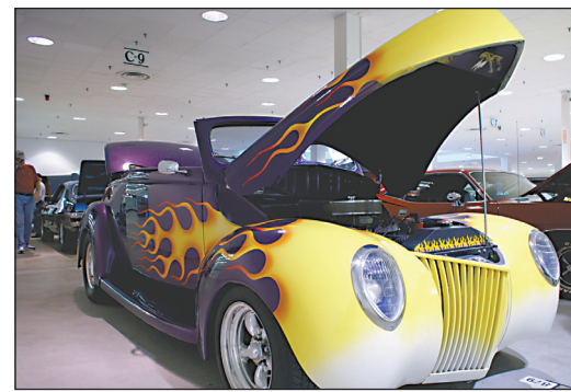
More photos on page 19