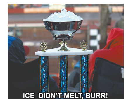
ICE DIDN'T MELT, BURR!