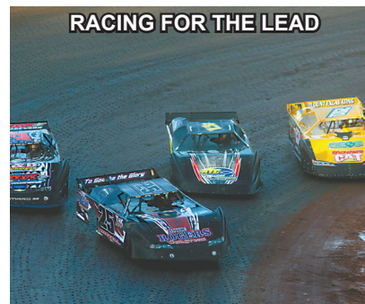
RACING FOR THE LEAD