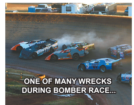
ONE OF MANY WRECKS DURING BOMBER RACE...