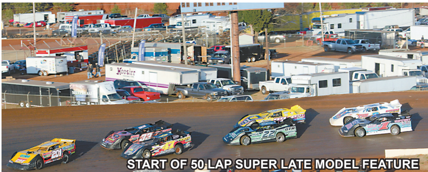
START OF 50-LAP SUPER LATE MODEL FEATURE