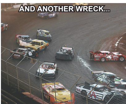
AND ANOTHER WRECK...