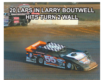
20 LAPS IN LARRY BOUTWELL HITS TURN 2 WALL