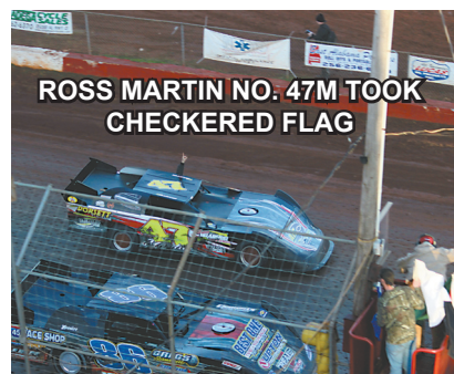
ROSS MARTIN NO. 47M TOOK CHECKERED FLAG