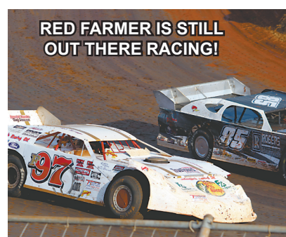
RED FARMER IS STILL OUT THERE RACING!